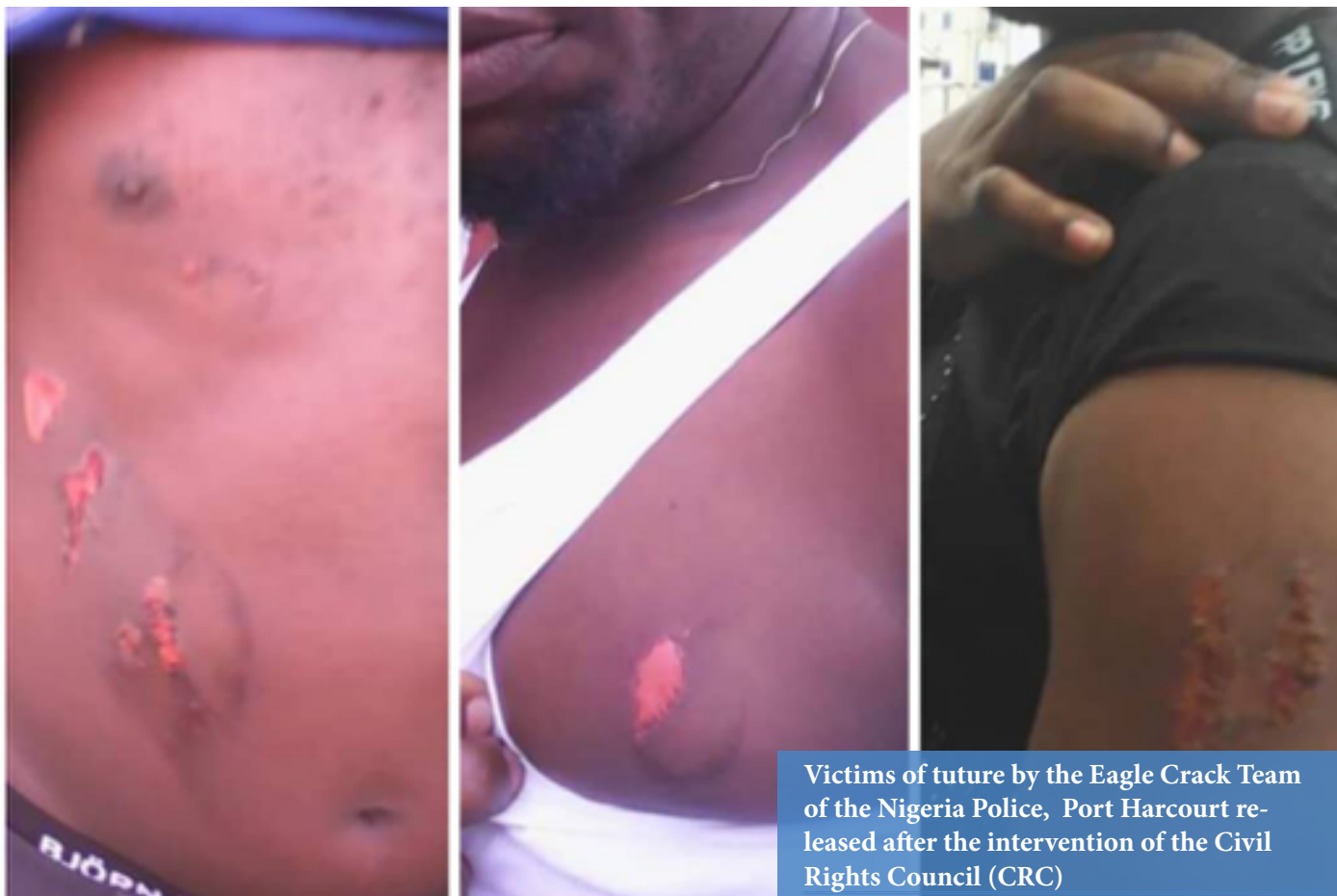
Victims of torture by the Eagle Crack Team of the Nigeria Police, Port Harcourt released after the intervention of the Civil Rights Council (CRC)