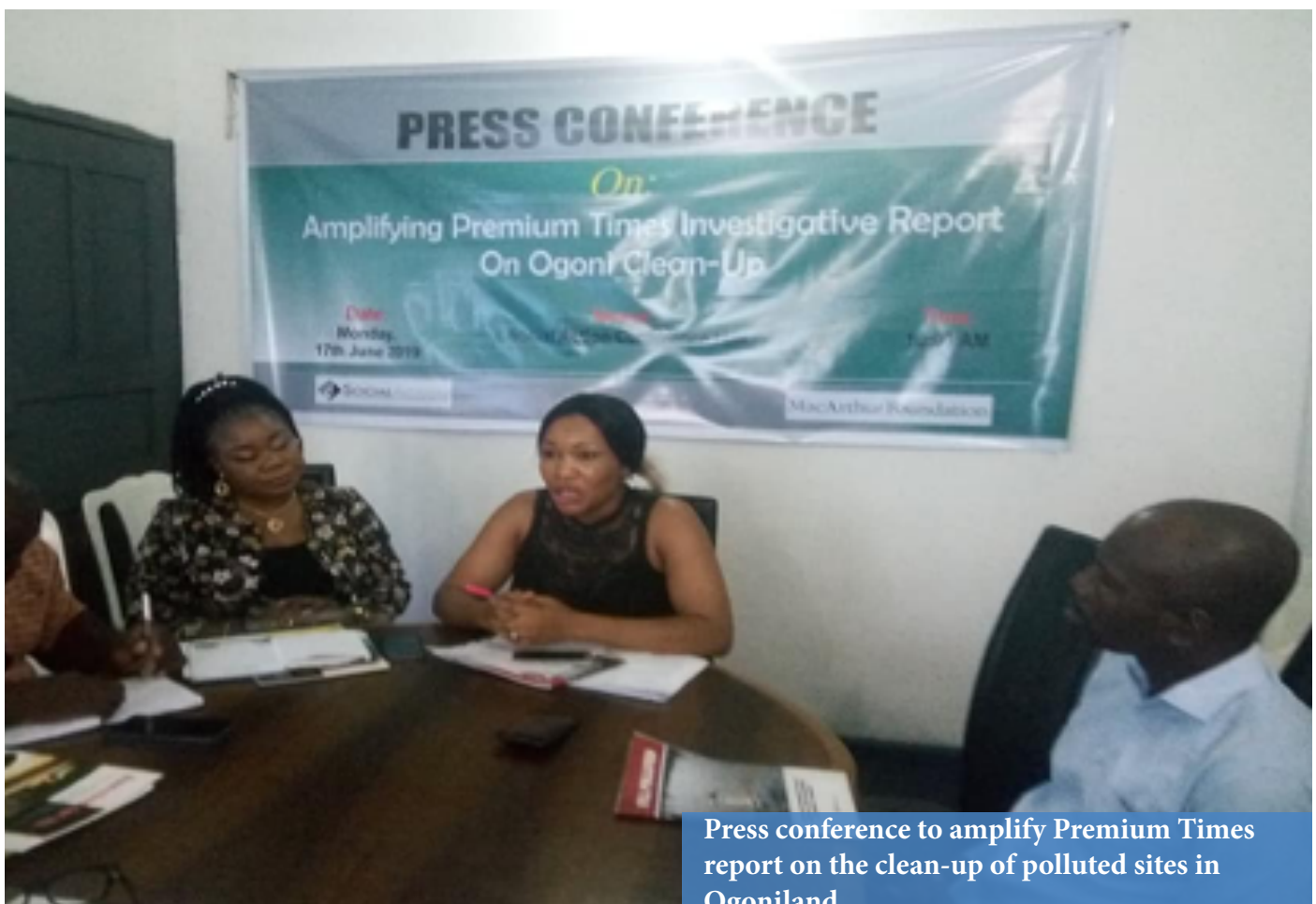
Press conference to amplify Premium Times report on the clean-up of polluted sites in Ogoniland

Social Action organised a Town Hall Meeting that brought together local community members and HYPREP in a rare HYPREP-Communities convergence. It afforded local community members, whose voices and concerns on the clean up in their area hardly get to the ears of or attention of HYPREP, to without constraints, engage HYPREP directly and voice out their observations, issues as well as concerns on the exercise.