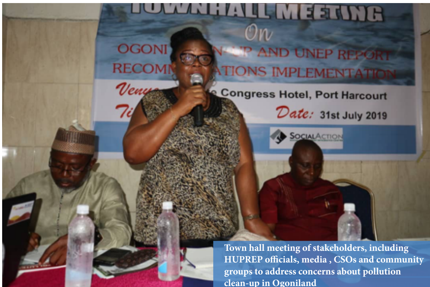
Town hall meeting of stakeholders, including HUPREP officials, media , CSOs and community groups to address concerns about pollution clean-up in Ogoniland