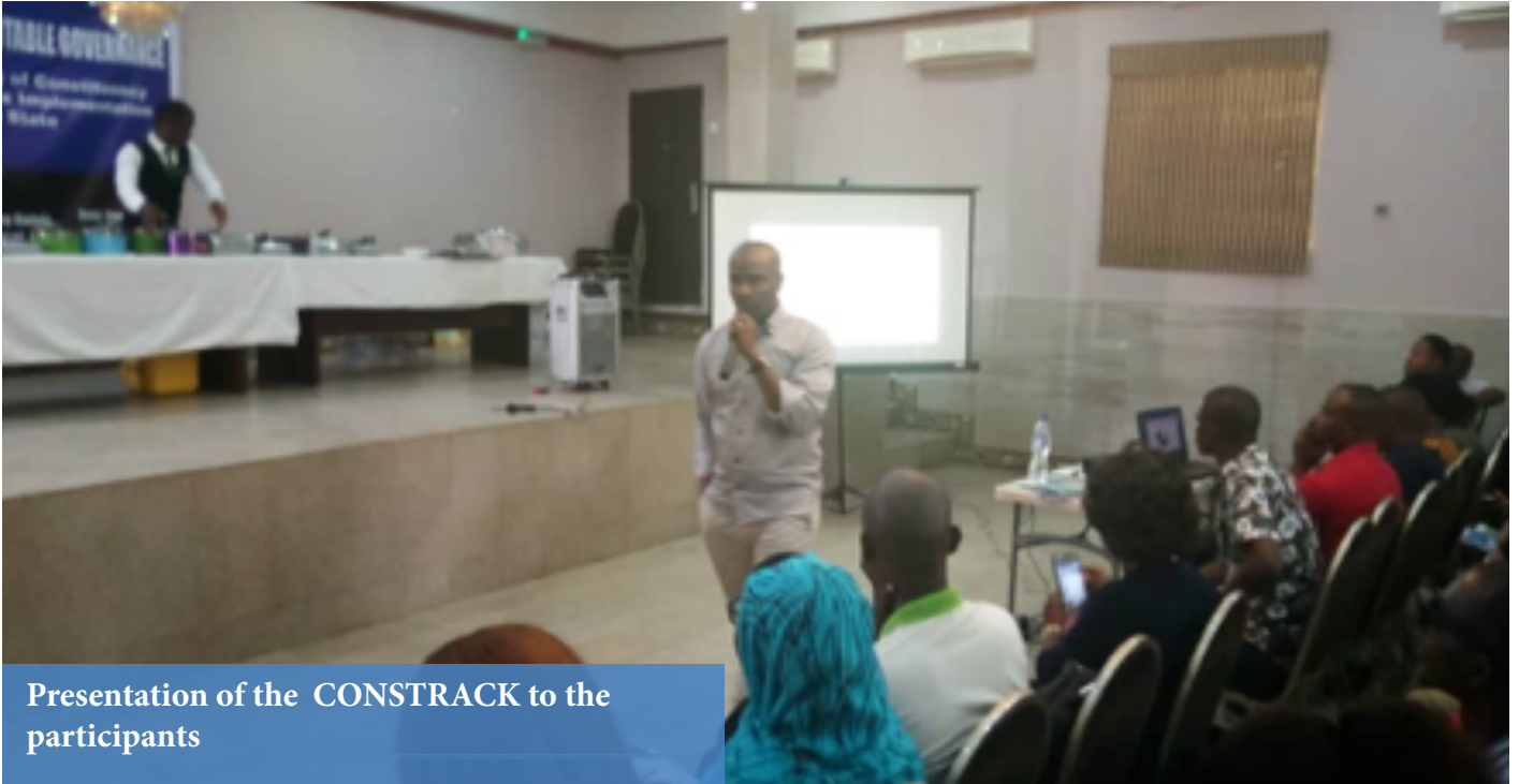
Presentation of the CONSTRACK to the participants