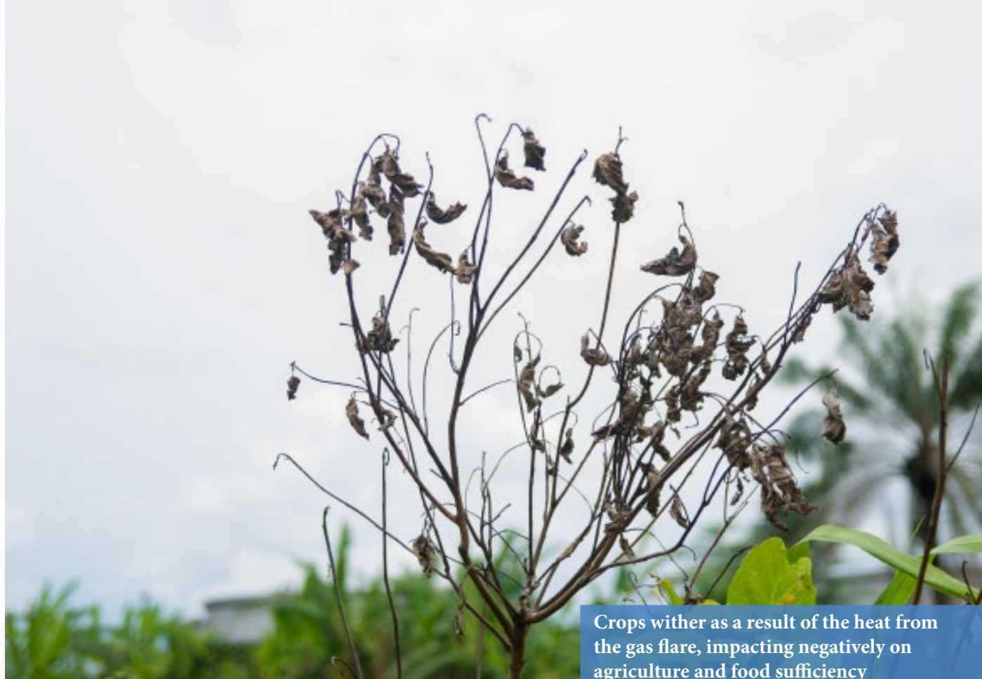
Crops wither as a result of the heat from the gas flare, impacting negatively on agriculture and food sufficiency