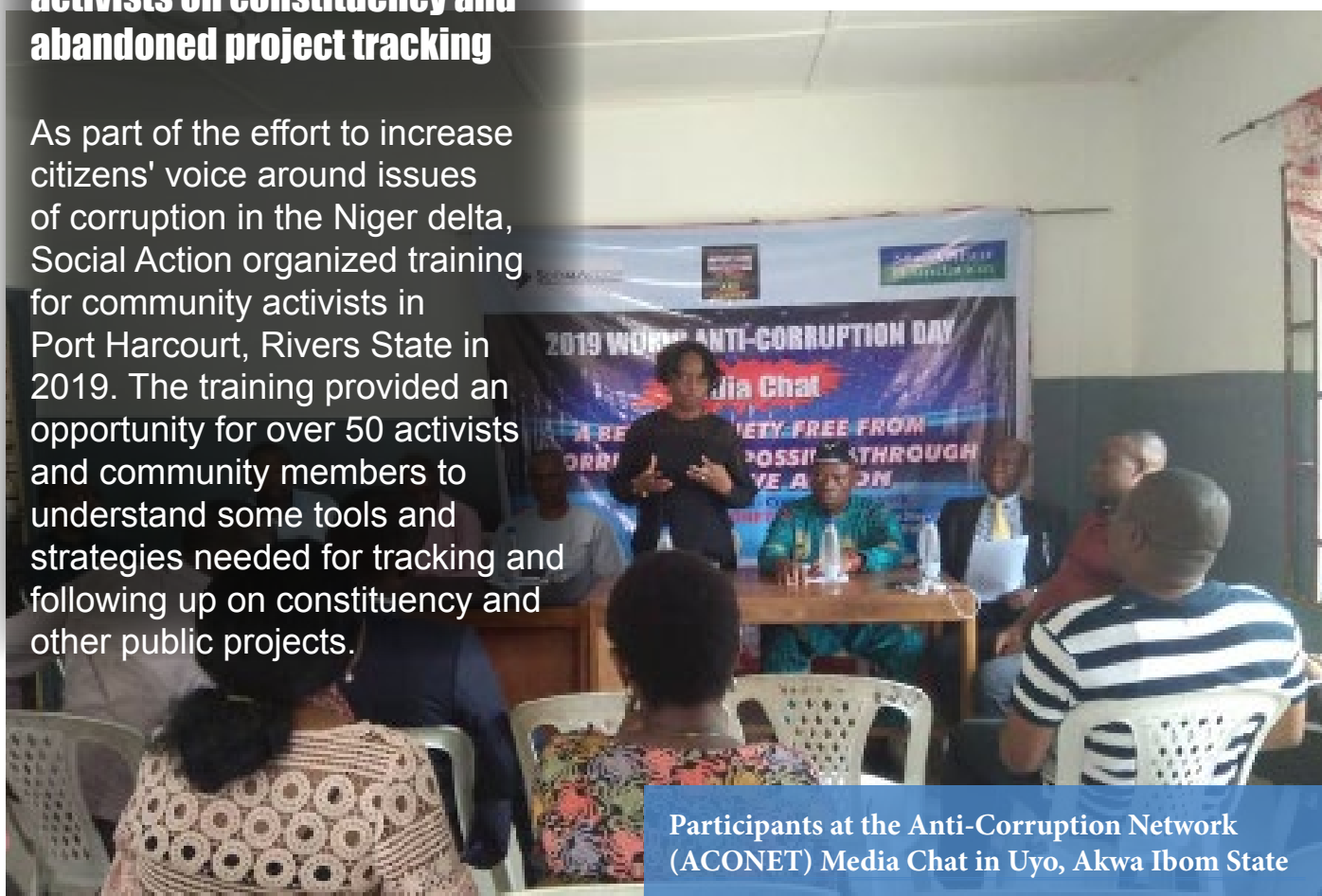
Participants at the Anti-Corruption Network (ACONET) Media Chat in Uyo, Akwa Ibom State

As part of the effort to increase citizens' voice around issues of corruption in the Niger delta, Social Action organized training for community activists in Port Harcourt, Rivers State in 2019. The training provided an opportunity for over 50 activists and community members to understand some tools and strategies needed for tracking and following up on constituency and other public projects.