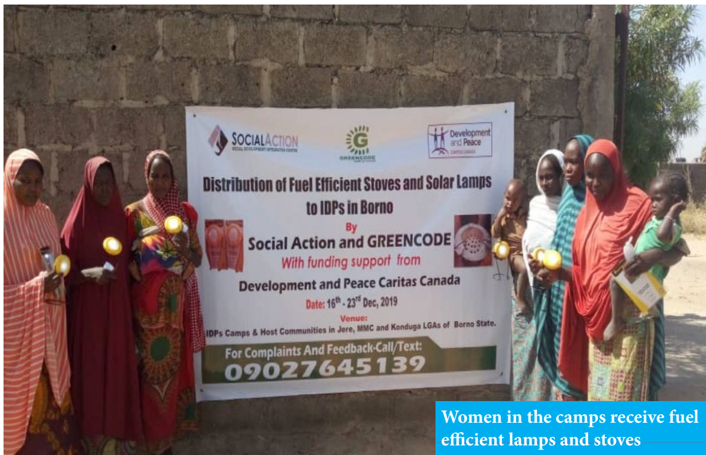
Women in the camps receive fuel efficient lamps and stoves