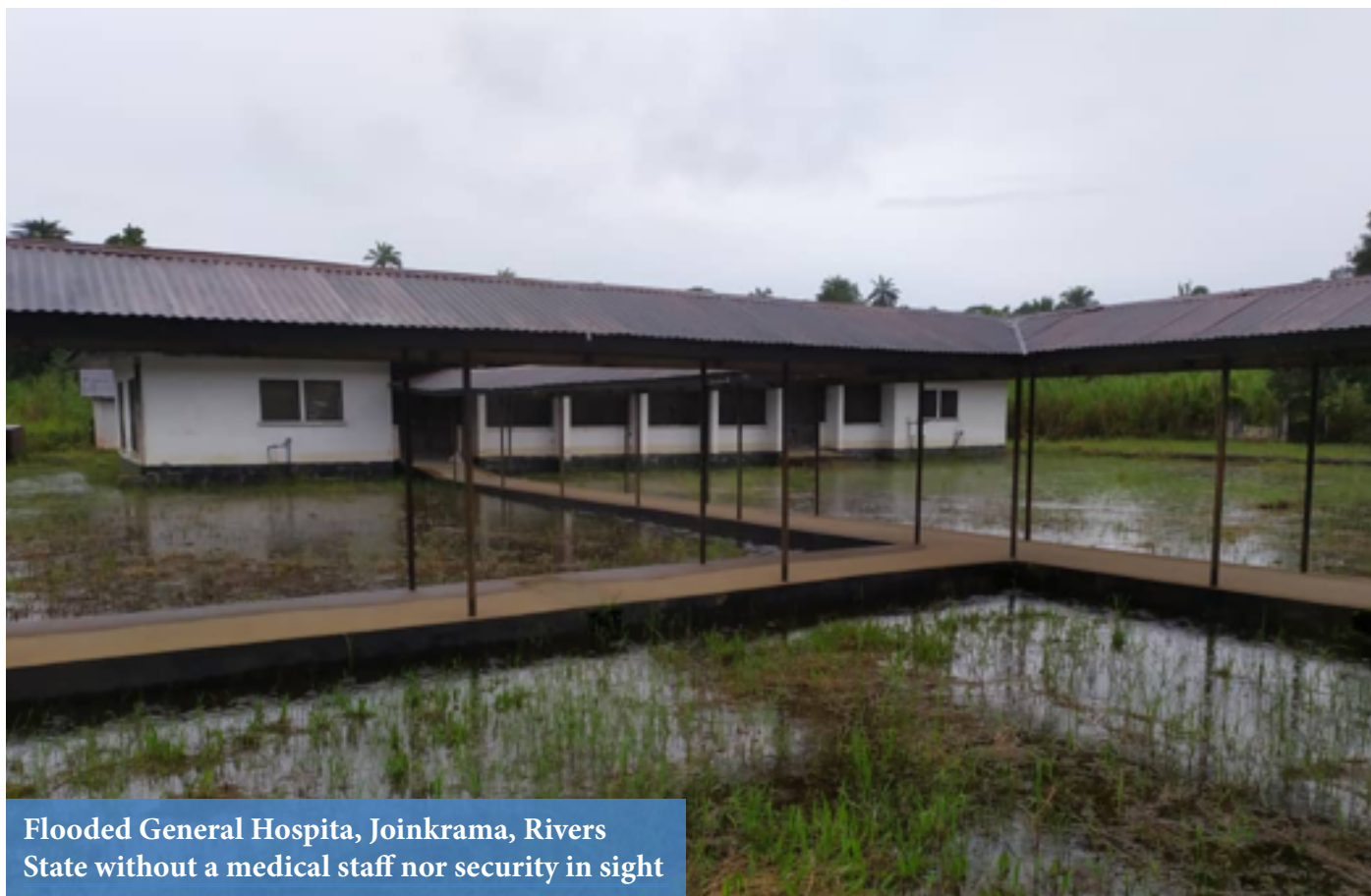
Flooded General Hospita, Joinkrama, Rivers State without a medical staff nor security in sight