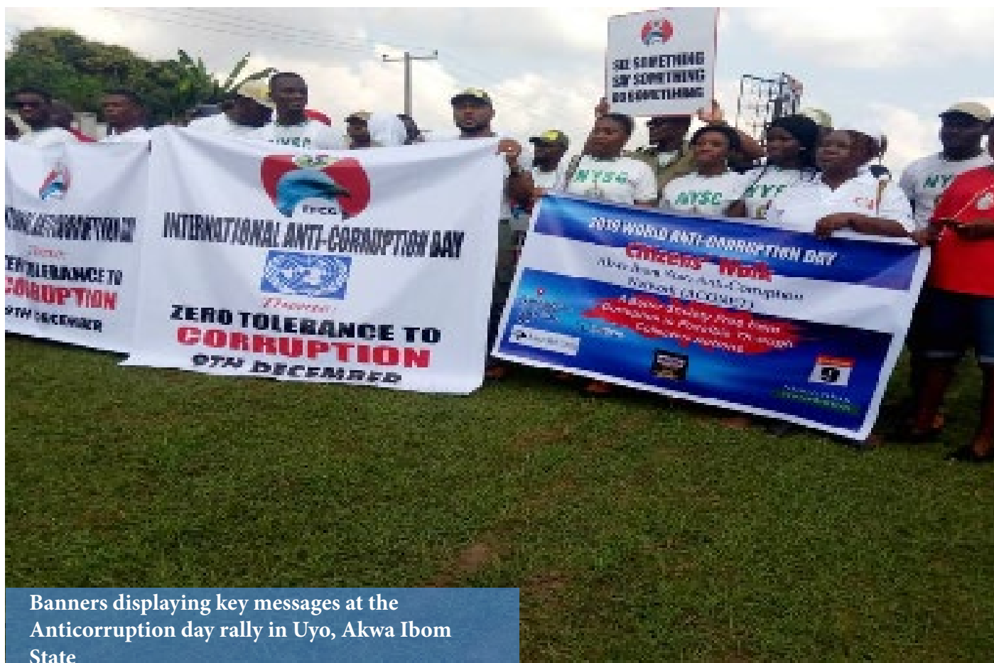
Banners displaying key messages at the Anticorruption day rally in Uyo, Akwa Ibom State