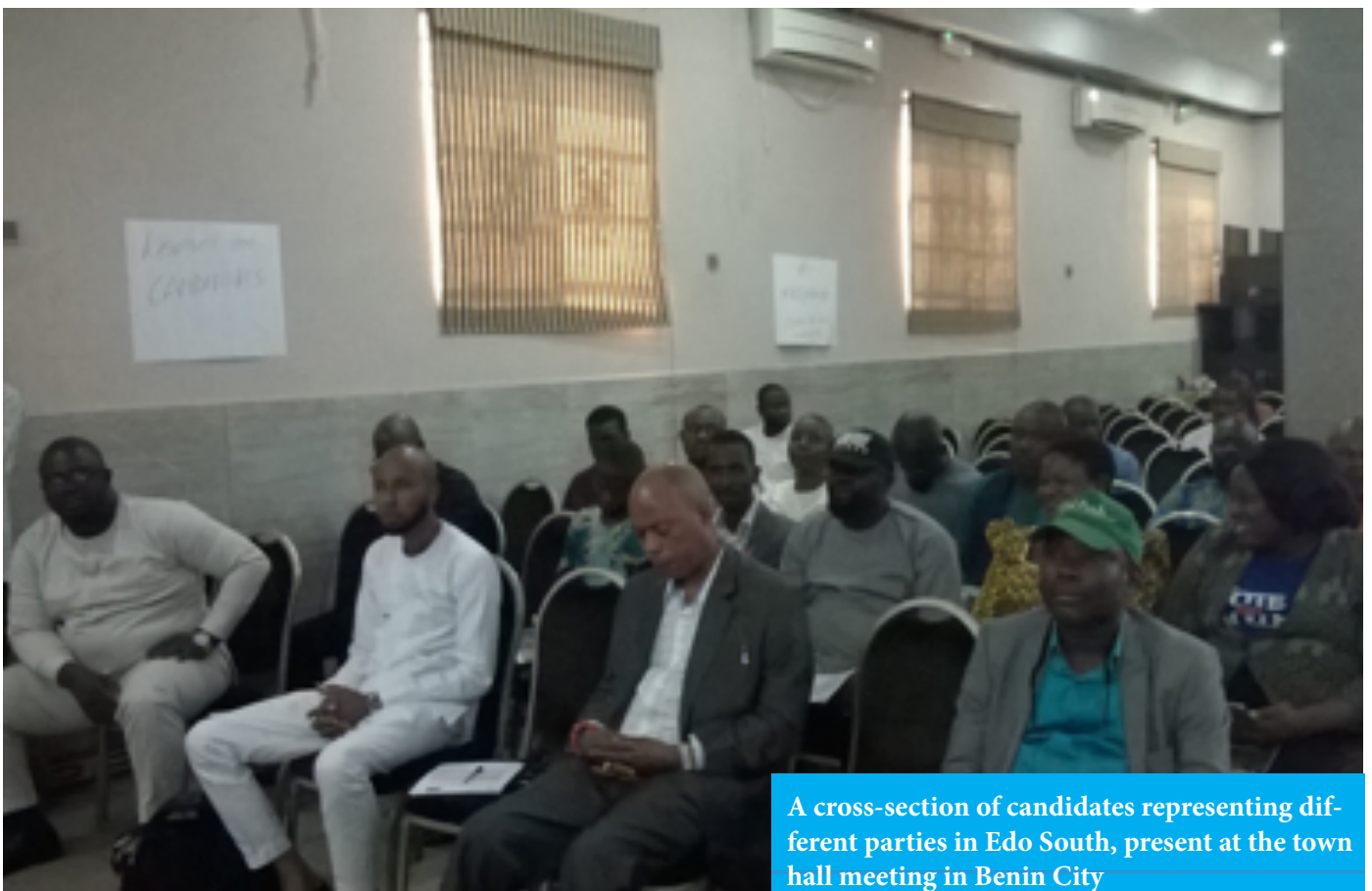
A cross-section of candidates representing different parties in Edo South, present at the town hall meeting in Benin City