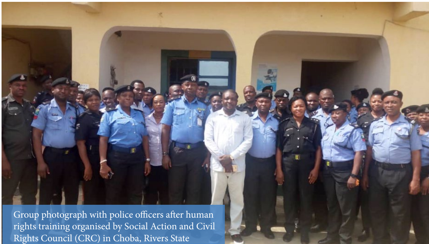
Group photograph with police officers after human rights training organised by Social Action and Civil Rights Council (CRC) in Choba, Rivers State