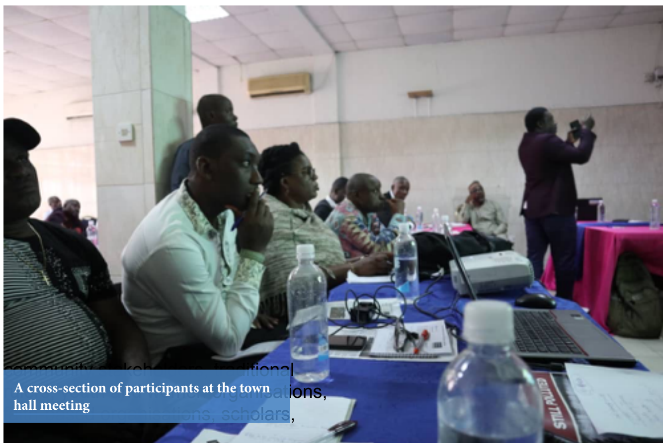
A cross-section of participants at the town hall meeting

Participants also examined bills before the National Assembly with relevance to communities in the site of petroleum extraction and made recommendations.