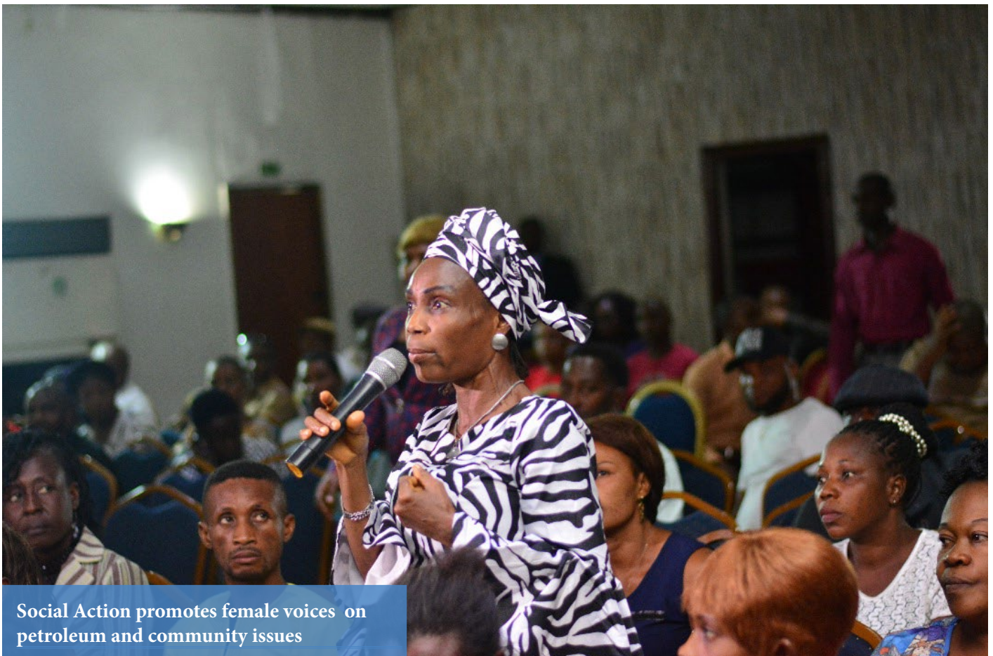
Social Action promotes female voices on petroleum and community issues

In 2019, we focused on gas flaring, the clean-up of polluted sites in the Niger Delta, and on the processes of enacting new federal legislation for the petroleum sector.