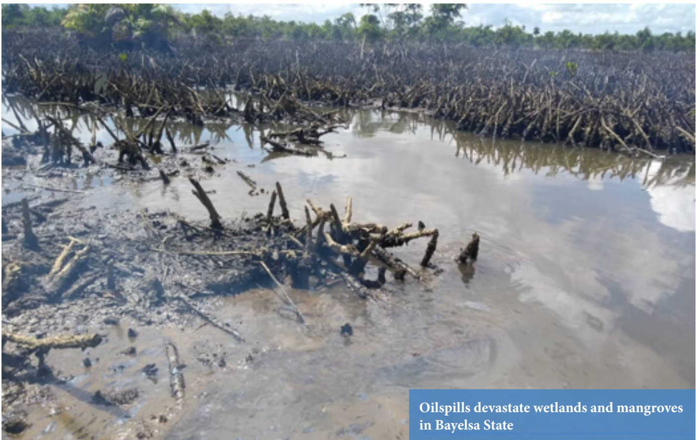
Oil spills devastate wetlands and mangroves in Bayelsa State

✓ We advocated against the Petroleum Industries Governance Bill (PIGB) as passed by the House of Representatives and the Senate as the legislation would promote corruption, undermine environmental regulation and community rights. We successfully called on President Buhari to withhold assent to the bill.