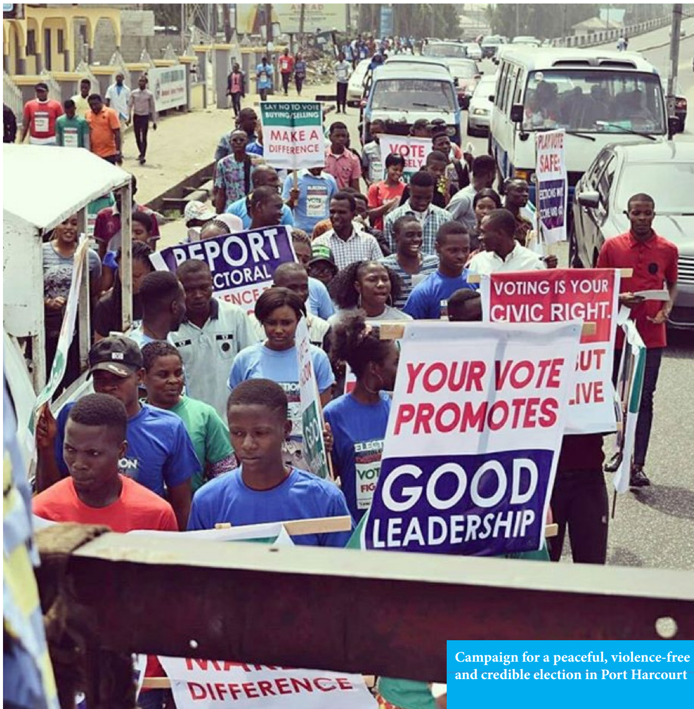
Campaign for a peaceful, violence-free and credible election in Port Harcourt