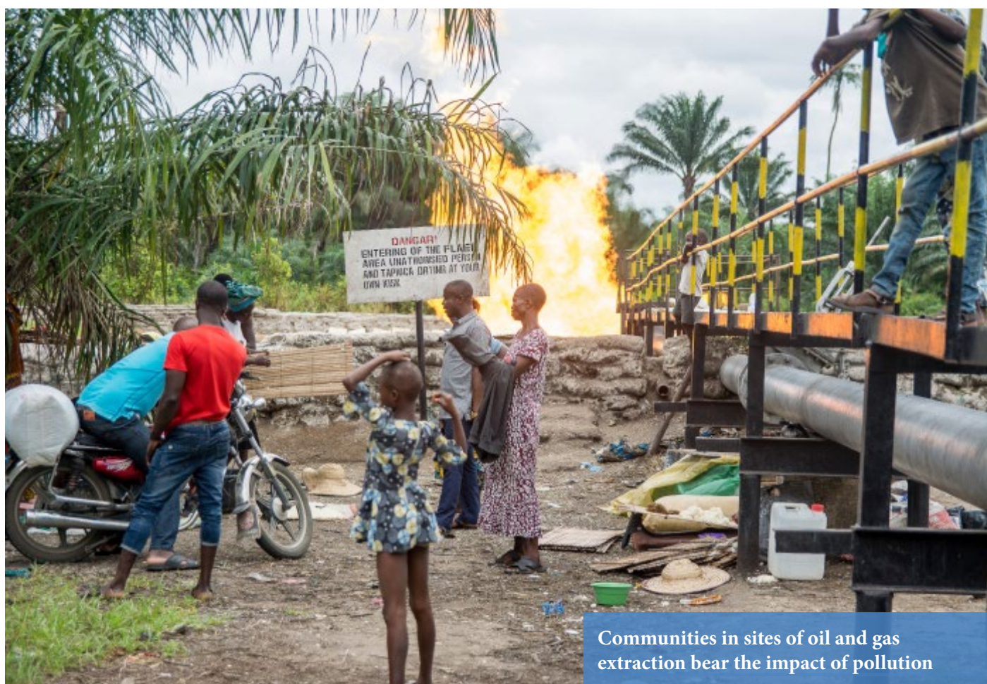
Communities in sites of oil and gas extraction bear the impact of pollution