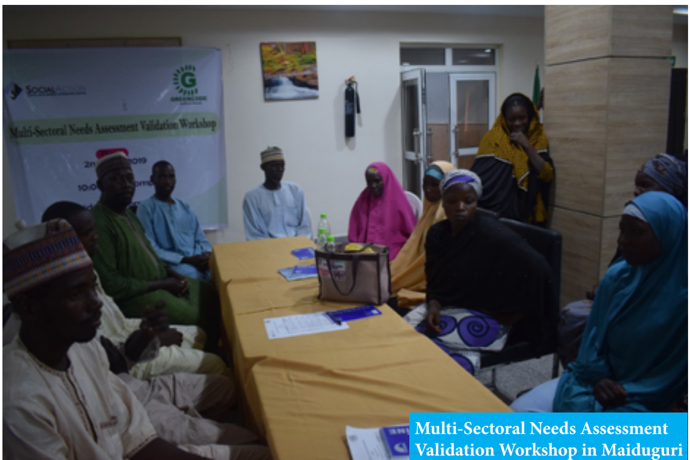
Multi-Sectoral Needs Assessment Validation Workshop in Maiduguri

We encourage the integration of community rights in the development and implementation of climate change mitigation and adaptation schemes in Nigeria.