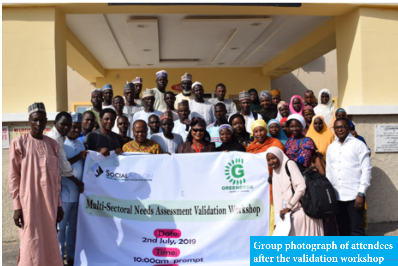
Group photograph of attendees after the validation workshop