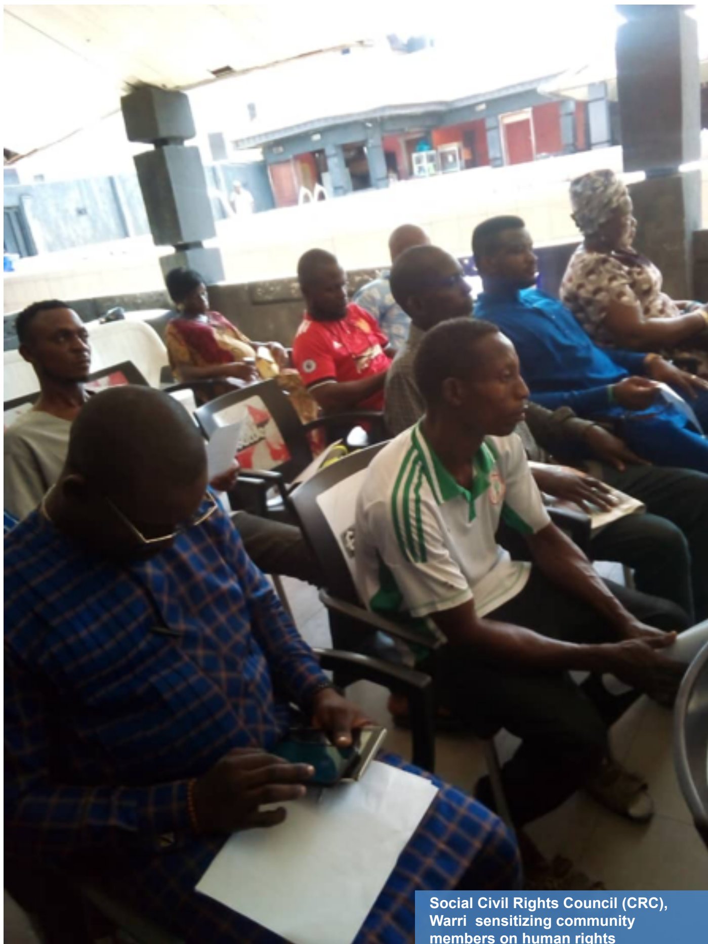
Social Civil Rights Council (CRC), Warri sensitizing community members on human rights