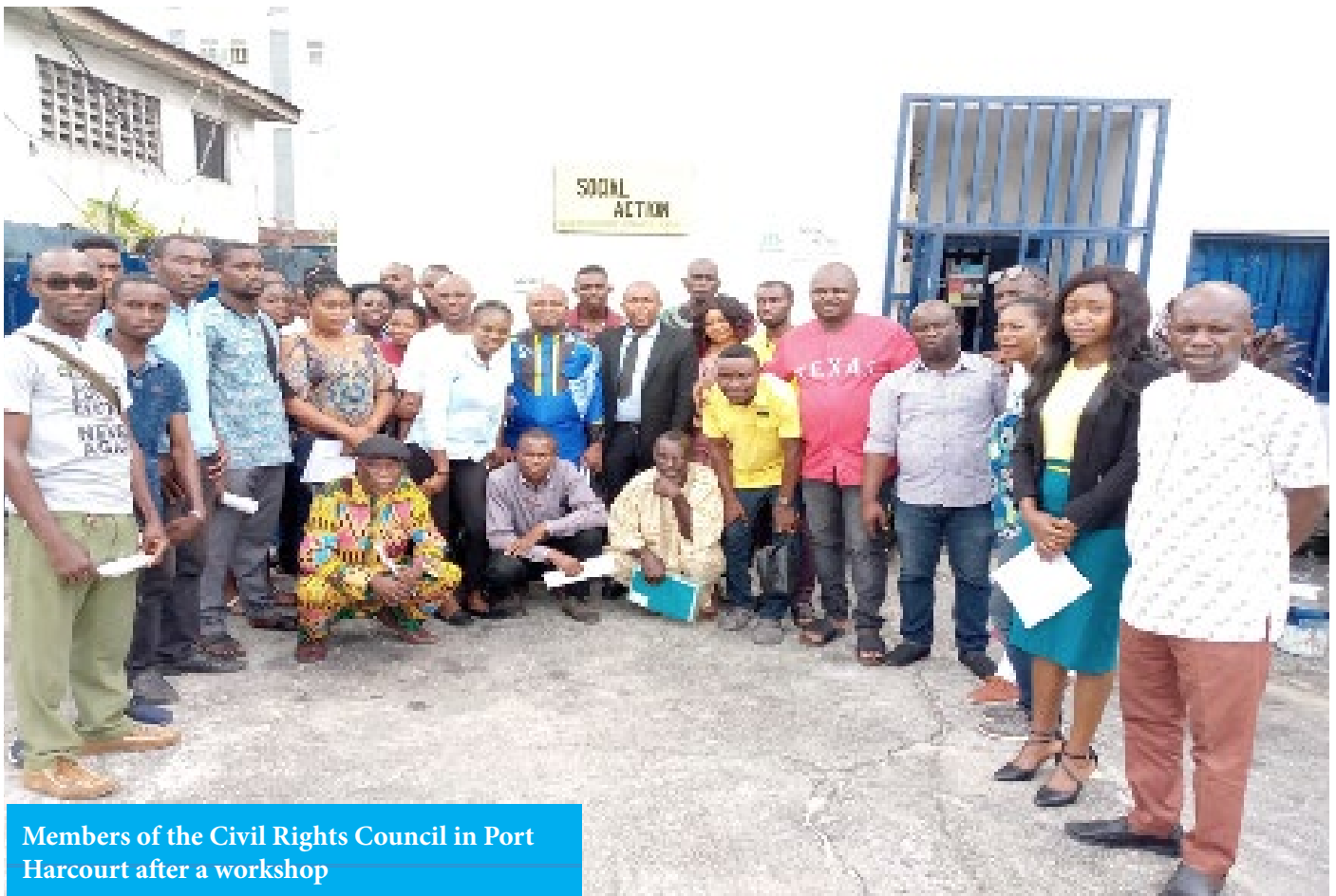
Members of the Civil Rights Council in Port Harcourt after a workshop