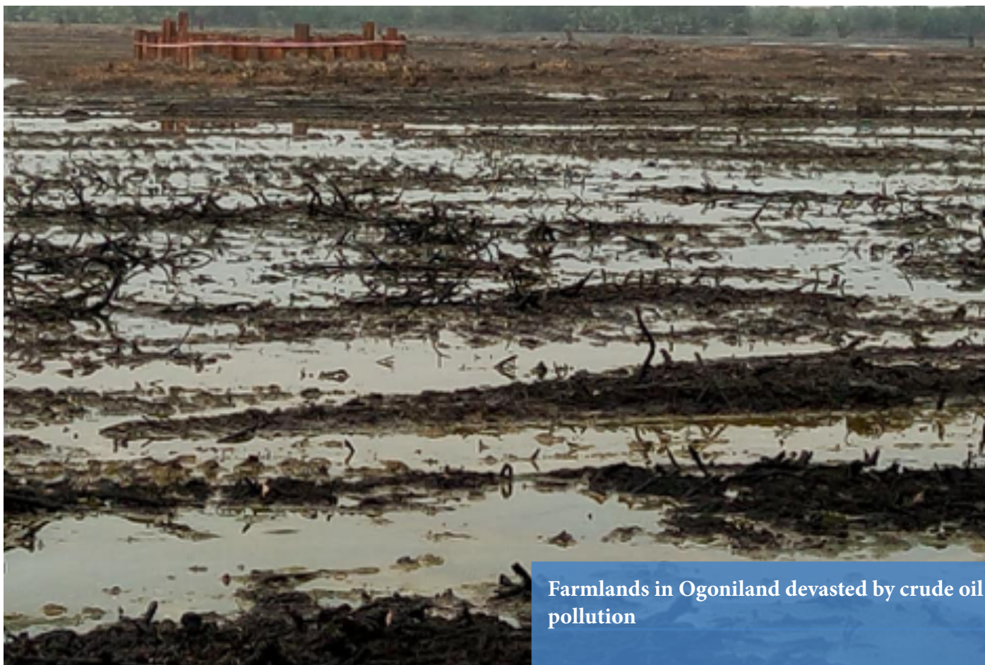
Farmlands in Ogoniland devastated by crude oil pollution