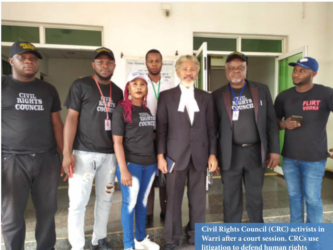
Civil Rights Council (CRC) activists in Warri after a court session. CRCs use litigation to defend human rights