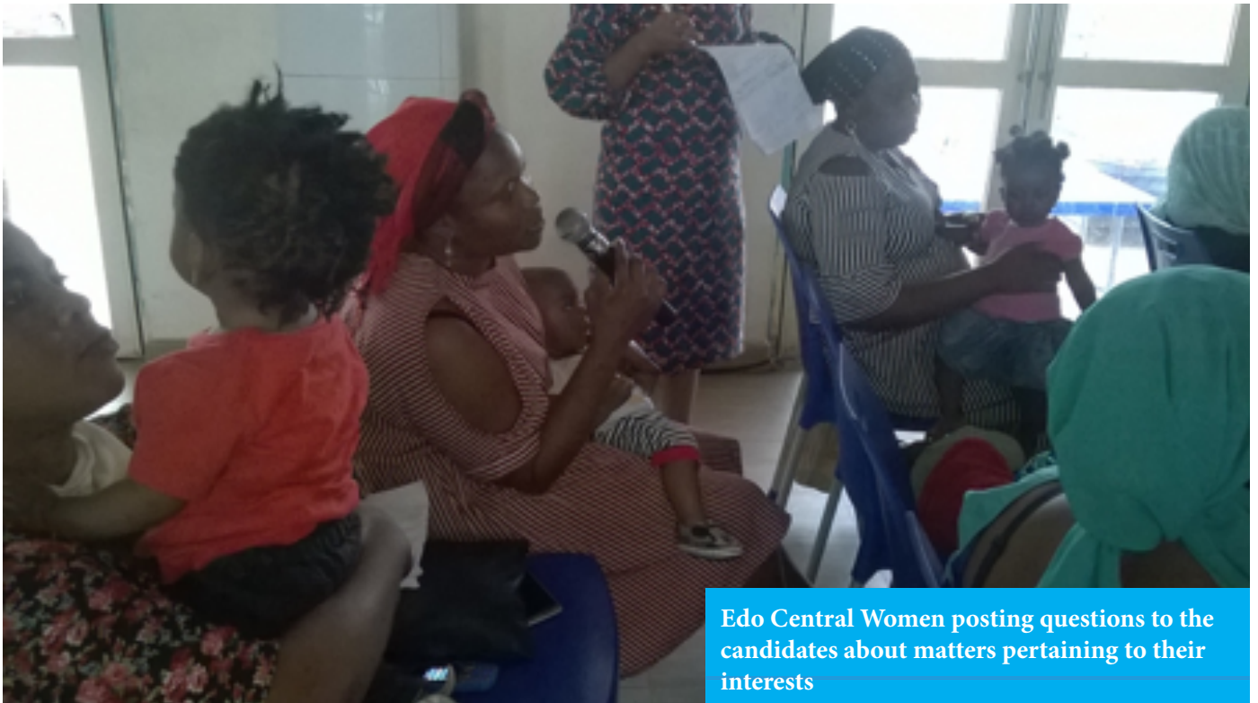
Edo Central Women posing questions to the candidates about matters pertaining to their interests