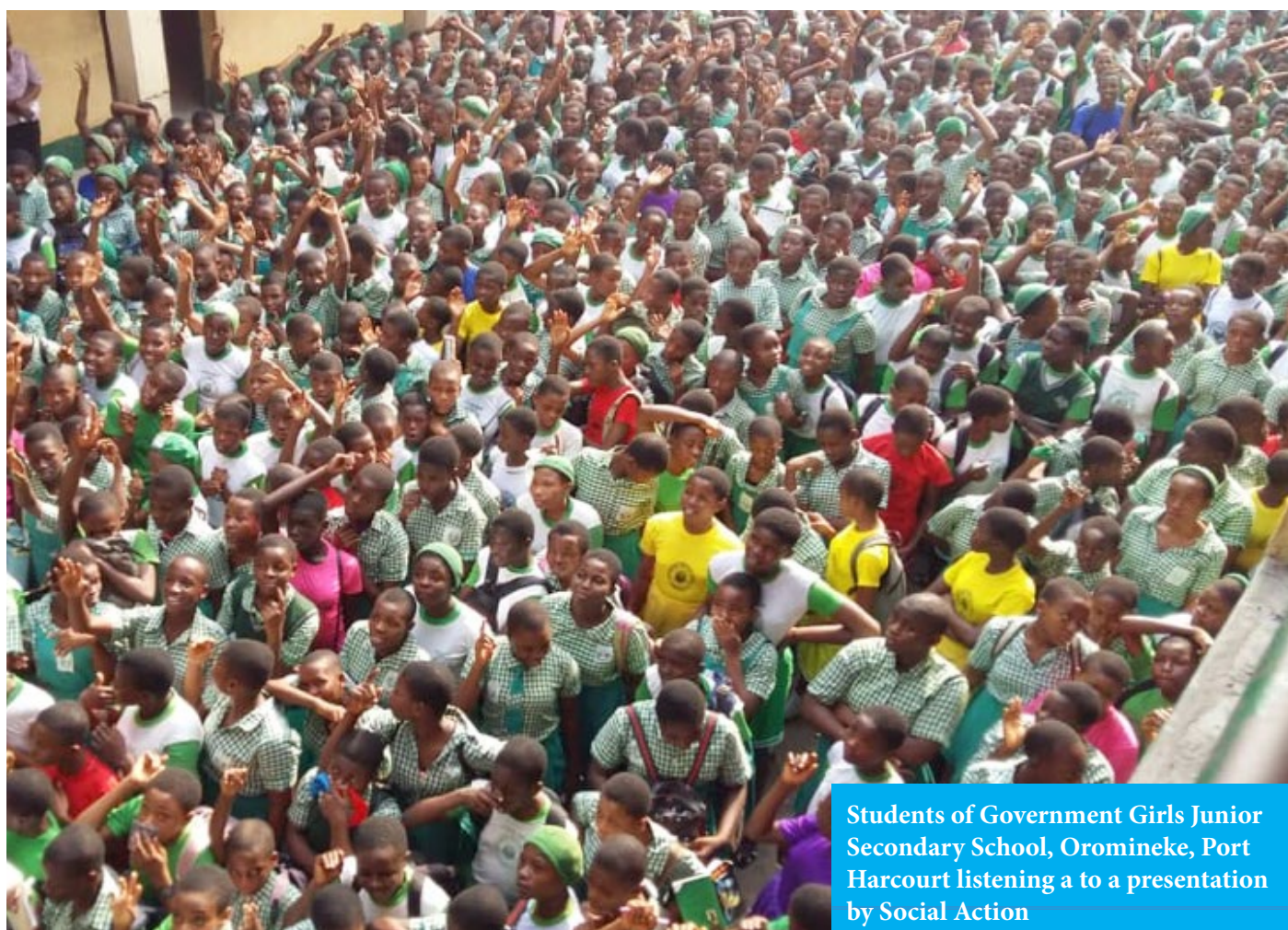
Students of Government Girls Junior Secondary School, Oromineke, Port Harcourt listening a to a presentation by Social Action

Social Action also sensitised secondary school students on the dangers of corruption, drug and sexual abuse, examination and other malpractice, including other social vices as harmful to their future. This picture shows students of Government Girls Junior Secondary School, Oromineke, Port Harcourt listening to a presentation by Social Action.