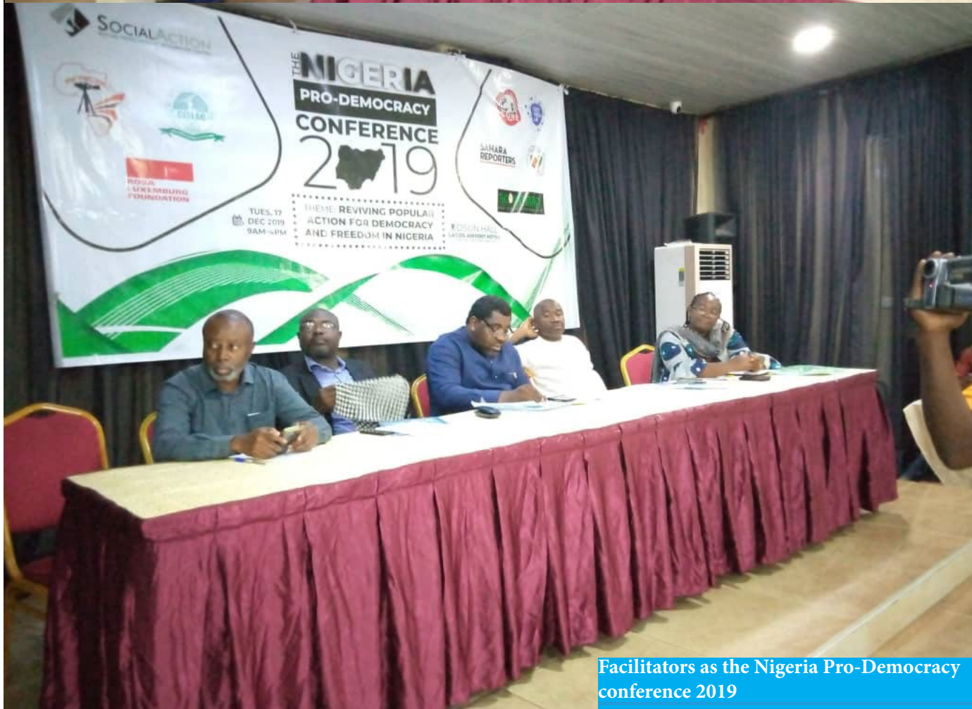
Facilitators as the Nigeria Pro-Democracy conference 2019