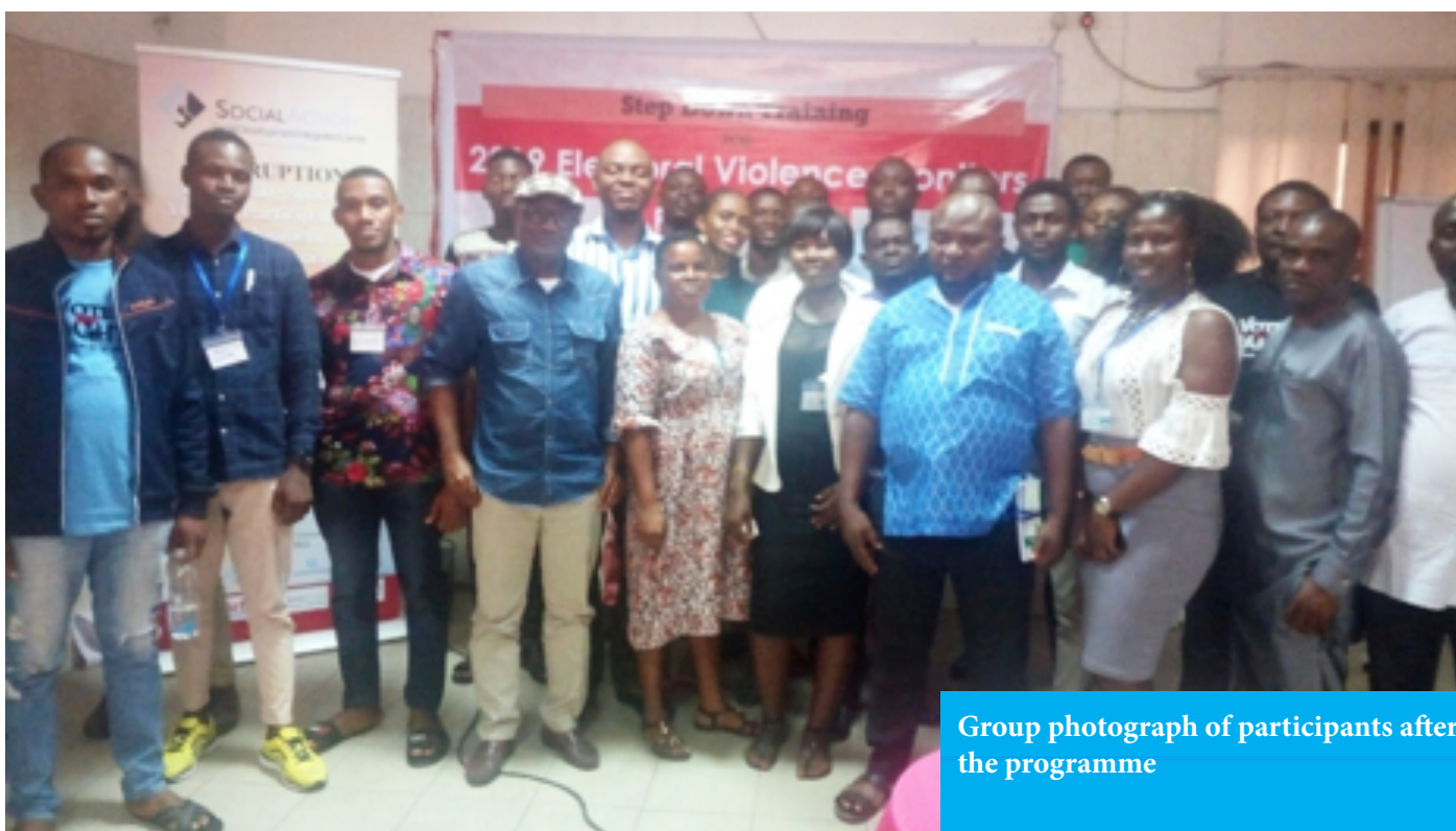
Group photograph of participants after the programme

We work with others to raise popular consciousness and participation through collaborative learning, mobilisation and solidarity for communities and activists working for environmental justice, democracy, and social change in Nigeria.