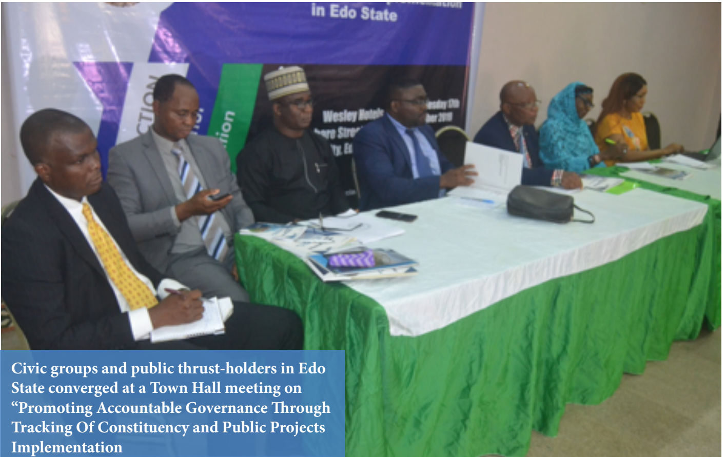
Civic groups and public thrust-holders in Edo State converged at a Town Hall meeting on “Promoting Accountable Governance Through Tracking Of Constituency and Public Projects Implementation