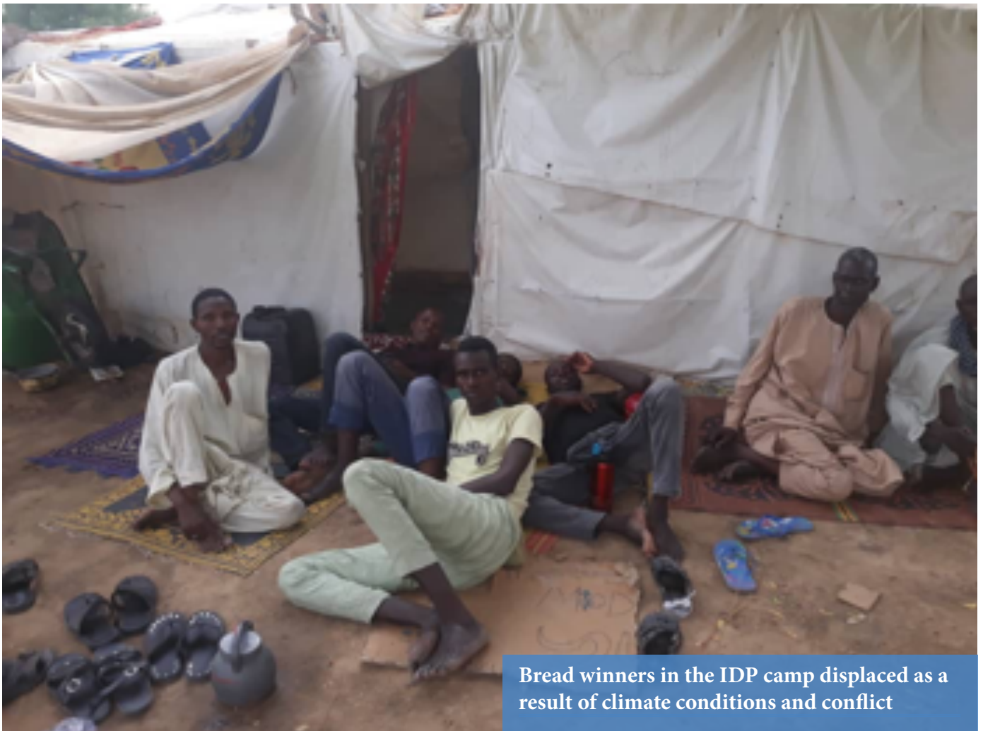
Bread winners in the IDP camp displaced as a result of climate conditions and conflict

✓ Social Action and Development and Peace – Caritas Canada produced the report, Boiling Over: Global Warming, Hunger and Violence in the Lake Chad Basin . The report addresses the need to integrate urgent humanitarian assistance to victims of conflict in the Lake Chad Basin while promoting ecological justice and sustained climate change adaptation measures.