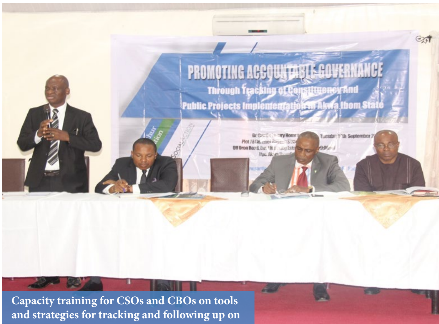
Capacity training for CSOs and CBOs on tools and strategies for tracking and following up on constituency and other public projects