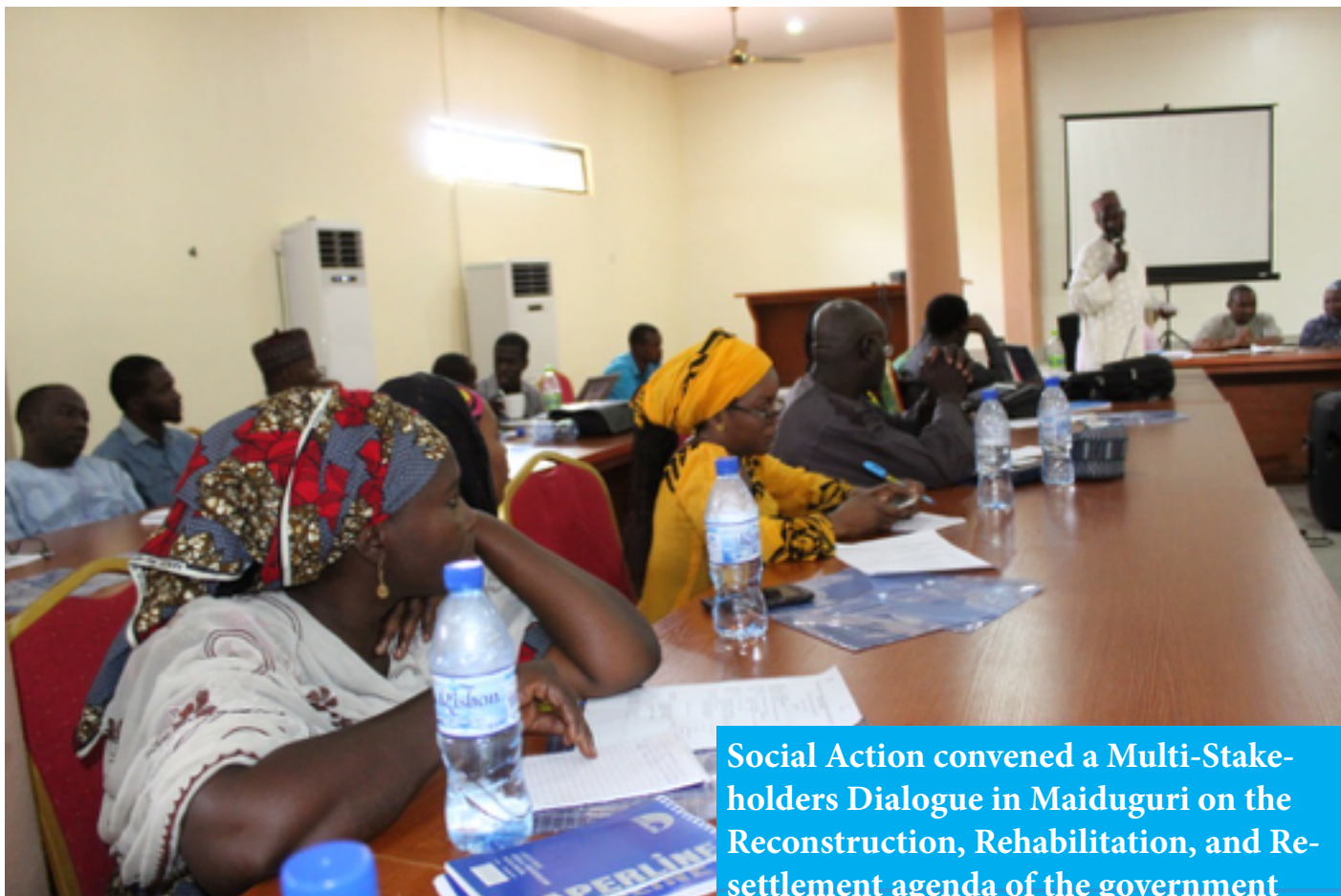
Social Action convened a Multi-Stakeholders Dialogue in Maiduguri on the Reconstruction, Rehabilitation, and Re-settlement agenda of the government