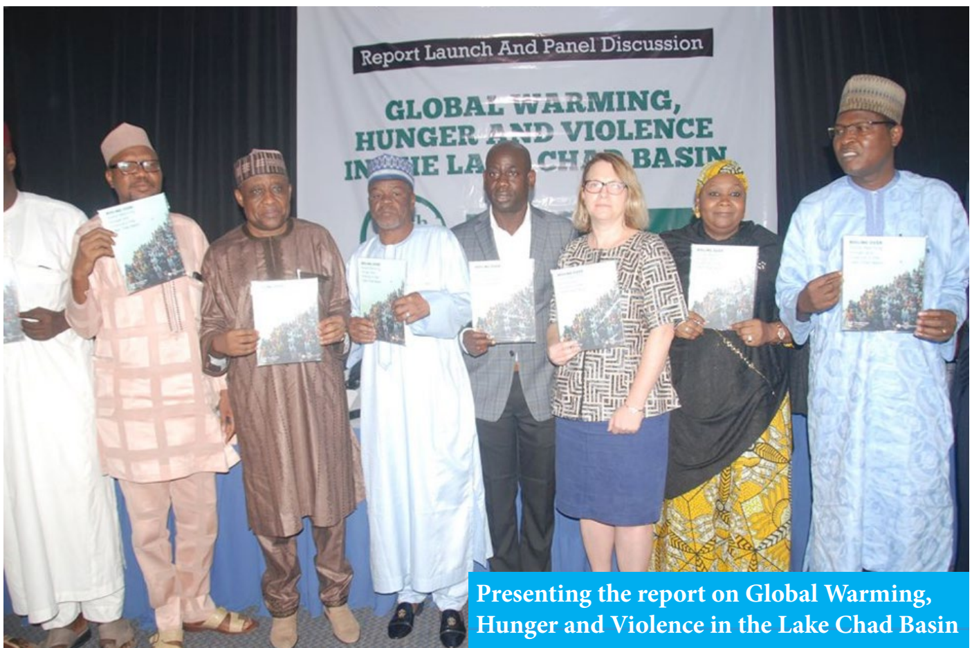
Presenting the report on Global Warming, Hunger and Violence in the Lake Chad Basin

actors including top federal and state government officials from northeast Nigeria, representatives of foreign missions and UN agencies, national and international NGOs, community leaders and activists and scholars from Nigeria and Cameroon. The event served as a platform for discussions on how to link climate change adaptation and rehabilitation of victims of conflict in northeastern Nigeria.