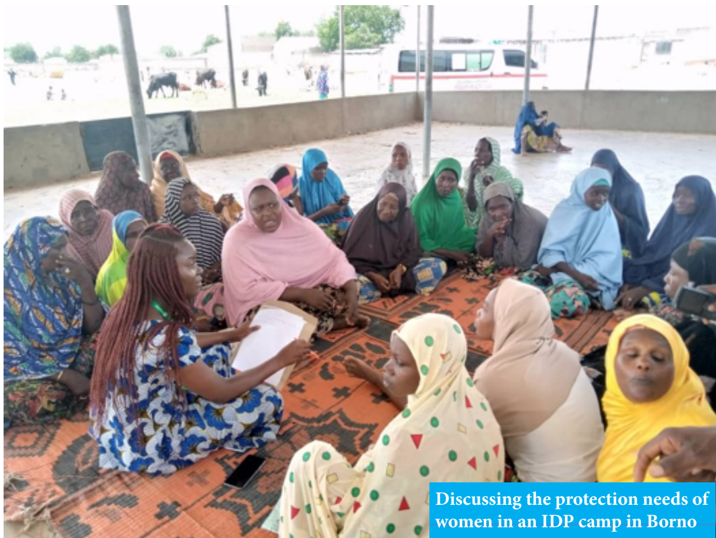
Discussing the protection needs of women in an IDP camp in Borno

The decade of violence conflict in the northeast region of Nigeria occasioned by climate change impact as well as the Boko Haram insurgency, has resulted in loss of lives, properties, means of livelihoods as well as general displacement among the citizens of the Sahel region