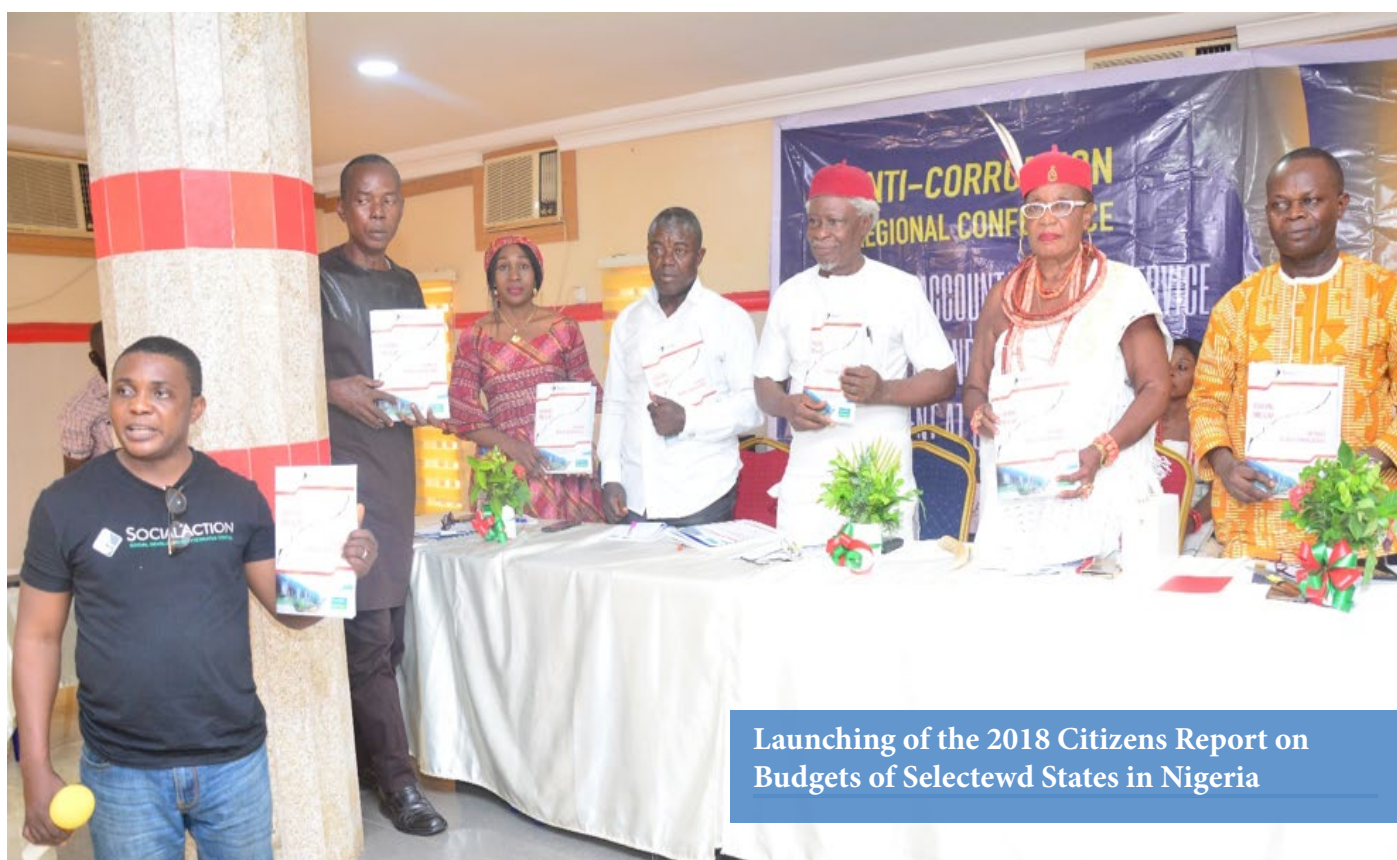
Launching of the 2018 Citizens Report on Budgets of Selected States in Nigeria

The study is based on months of field assessment of performance analysis of budget and fiscal documents interviews with local residents and relevant officials. The assessment also appraised the implementation of random selected projects in three key social and economic sectors of Health, Education and Agriculture