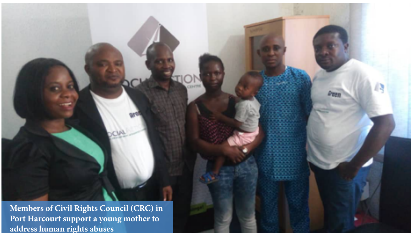
Members of Civil Rights Council (CRC) in Port Harcourt support a young mother to address human rights abuses