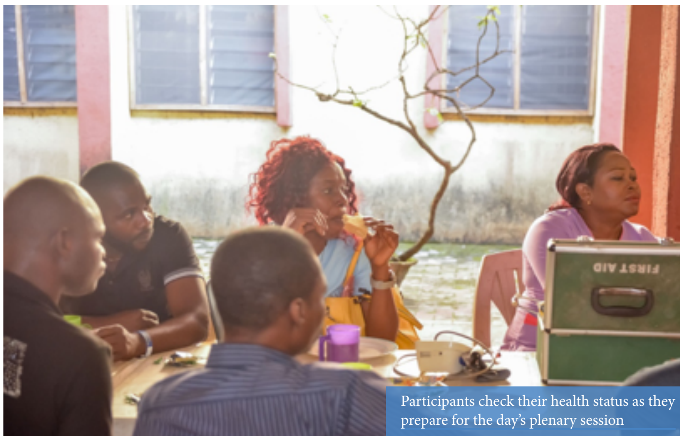
Participants check their health status as they prepare for the day's plenary session