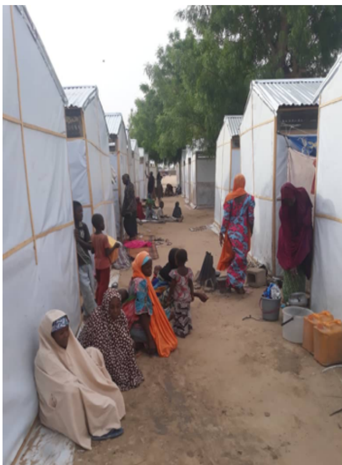
The vulnerable women and children at the IDP camp in Borno State hoping to be resettled in their ancestral homes