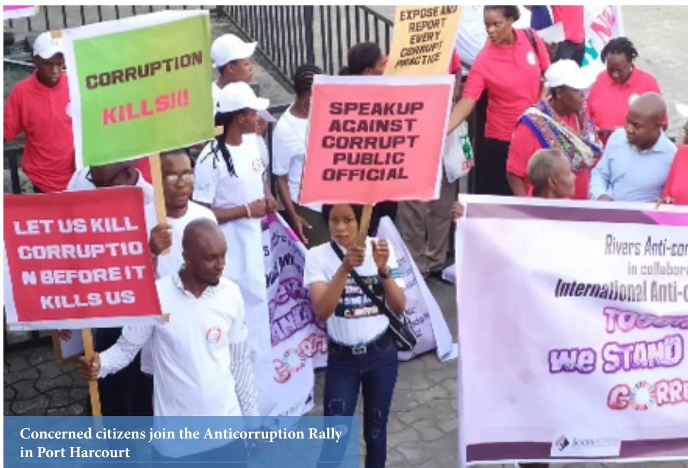
Concerned citizens join the Anticorruption Rally in Port Harcourt