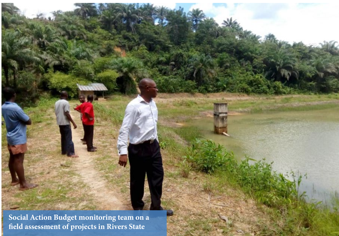
Social Action Budget monitoring team on a field assessment of projects in Rivers State