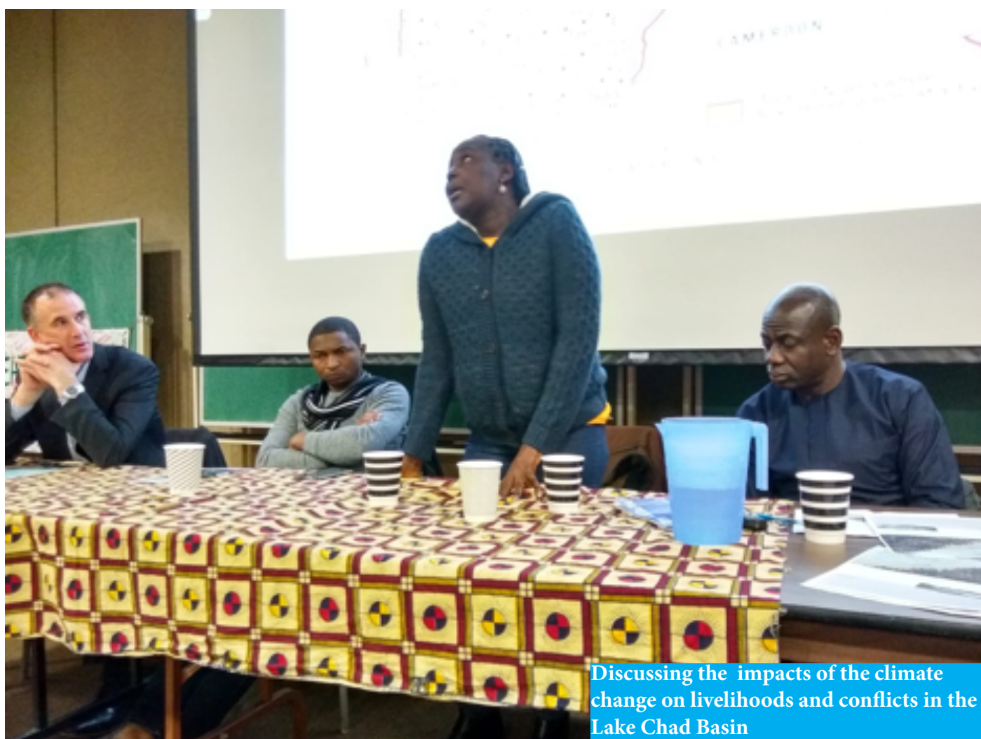
Discussing the impacts of the climate change on livelihoods and conflicts in the Lake Chad Basin

Social Action contributed to improving knowledge and awareness about the potential impacts of the Reducing Emissions from Deforestation and Forest Degradation (REDD+) in Cross River and Ondo States.