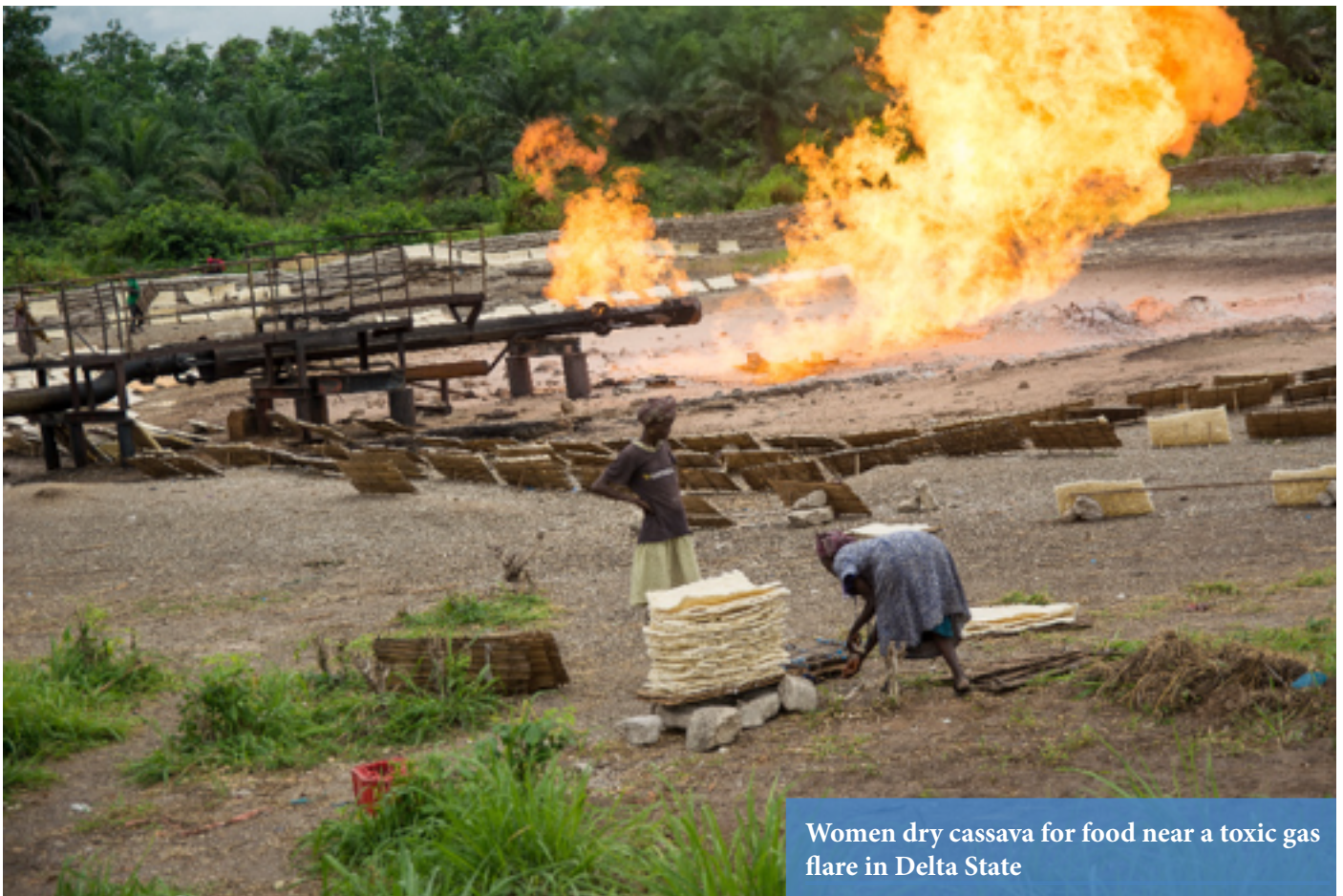
Women dry cassava for food near a toxic gas flare in Delta State