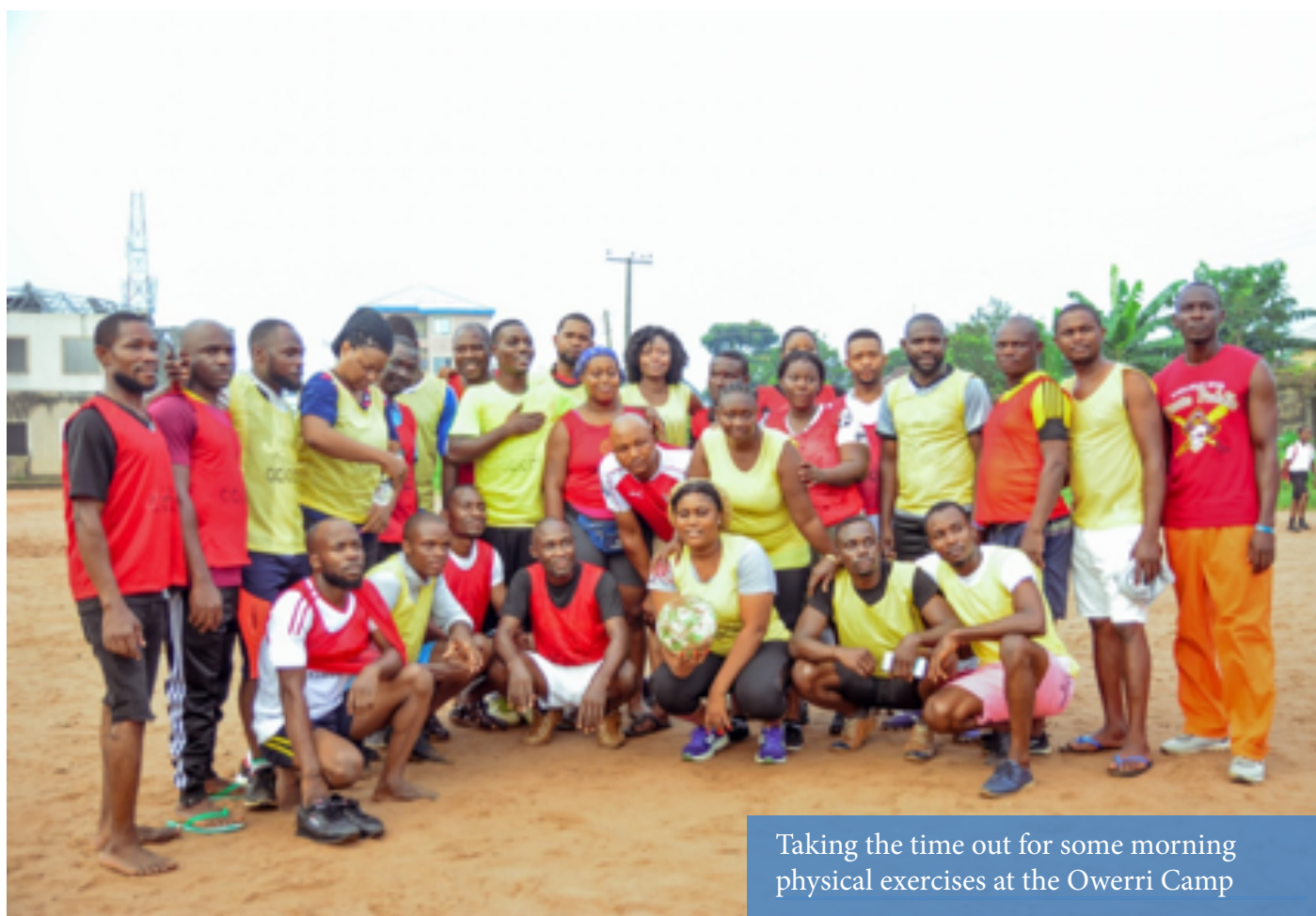
Taking the time out for some morning physical exercises at the Owerri Camp