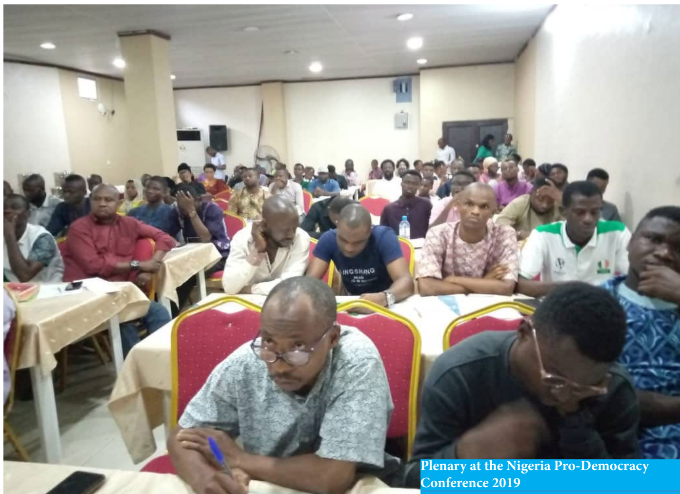
Plenary at the Nigeria Pro-Democracy Conference 2019

The conference was organised in solidarity with African Centre for Media & Information Literacy (AFRICMIL) the Civil Society Legislative Advocacy Centre (CISLAC) and other organisations.