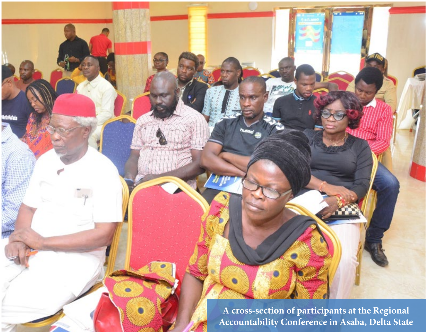
A cross-section of participants at the Regional Accountability Conference in Asaba, Delta State

The conference had in attendance, Civil Society Organisations, members and representatives of the local and state governments in the Niger Delta, the law enforcement and antigraft agencies, community, youth and women groups and scholars and researchers