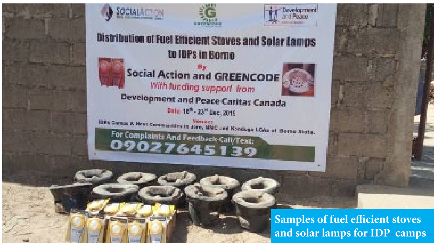
Samples of fuel efficient stoves and solar lamps for IDP camps