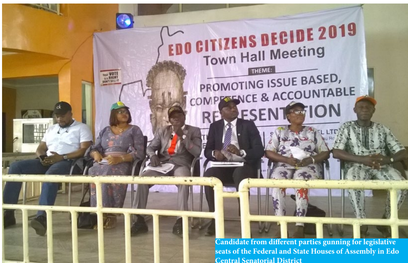
Candidate from different parties gunning for legislative seats of the Federal and State Houses of Assembly in Edo Central Senatorial District

We organised The Rivers Debate 2019 in collaboration with other civil society partners. Some gubernatorial candidates presented their agendas, enabling citizens and undecided voters who want to vote based on ideology to take a position. These events were aired live on national television.