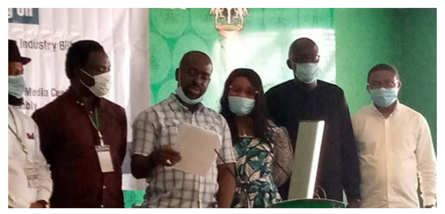
Social Acton and partner civil society organisations making a presentation on the NDDC at the National Assembly