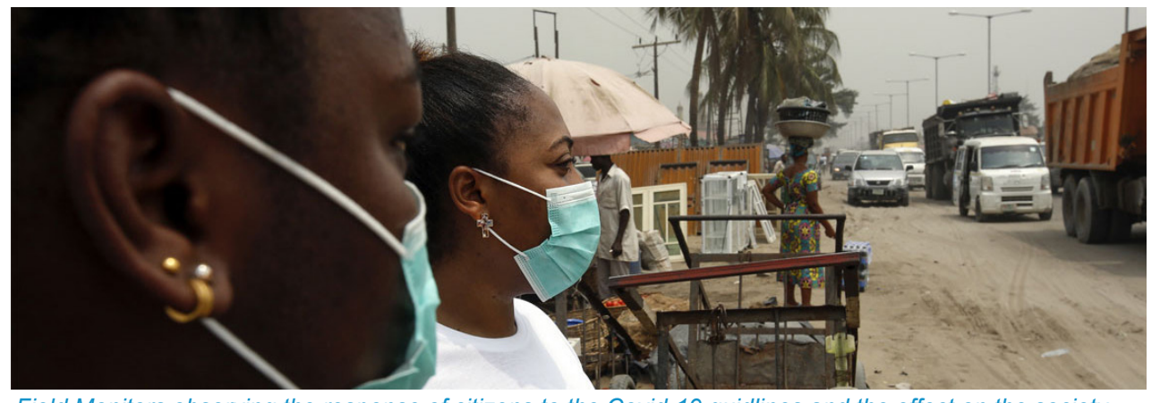
Field Monitors observing the response of citizens to the Covid-19 guidlines and the effect on the society

Social Action mobilised civil society partners and other allies such as the media and other social actors in Edo, Delta, Bayelsa, Rivers, Akwa Ibom States and Borno to collaborate and advocate for improved measures to protect the health, livelihoods and human rights of citizens and residents during the period of the COVID-19 pandemic.