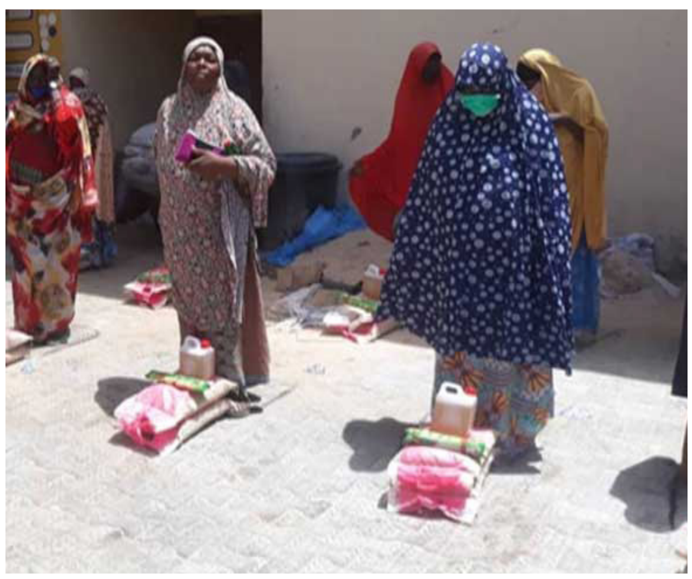
Women in the IDP Camps in the North receiving food materials from donors

Social Action took action to protect its staff, volunteers, allies, and beneficiary communities' health and safety by ensuring social distancing protocols and avoiding gatherings unrelated to COVID-19 intervention and procurement of hand sanitisers, face masks, and gloves for people involved in project implementation and community beneficiaries. Social Action reduced COVID-19 related vulnerability among IDPs in Borno by providing personal protective gear to 600 IDP households. It also contributed to the reduced spread of COVID-19 among the IDPs through awareness, sensitisation and education in 10 IDP camps while also reducing hunger by providing food supplies to some 1200 beneficiaries.