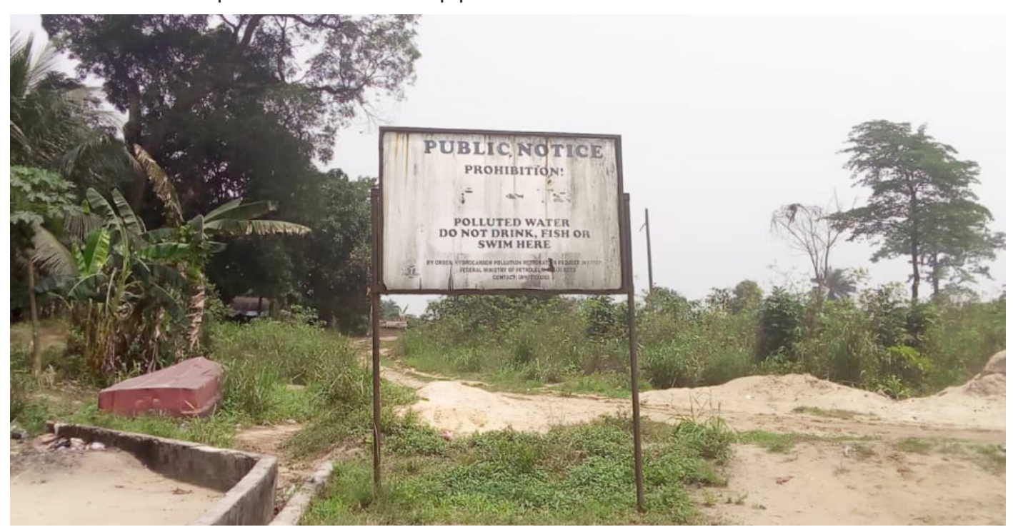
A prohibition sign by the bank of Naaben River, warning against the use of the river

Social Action continued to monitor government and other stakeholders' actions concerning the proposed clean-up of polluted sites in Ogoniland as recommended by the UNEP. Social Action monitoring informed collaborative advocacy with host communities and press statements to highlight concerns and inadequacies on the clean-up process in 2020.