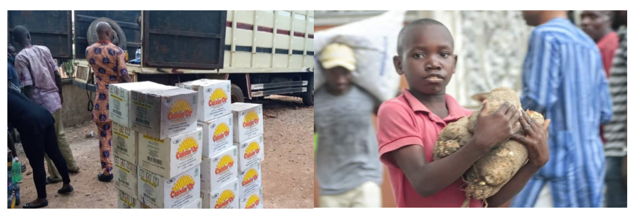
Distribution of paliative materials to the needy

Social Action-led efforts achieved a civil society and state governments partnership in monitoring and ensuring the equitable distribution of palliative materials to vulnerable populations in Bayelsa, Abia, Bayelsa, Cross River, Edo and Rivers States.