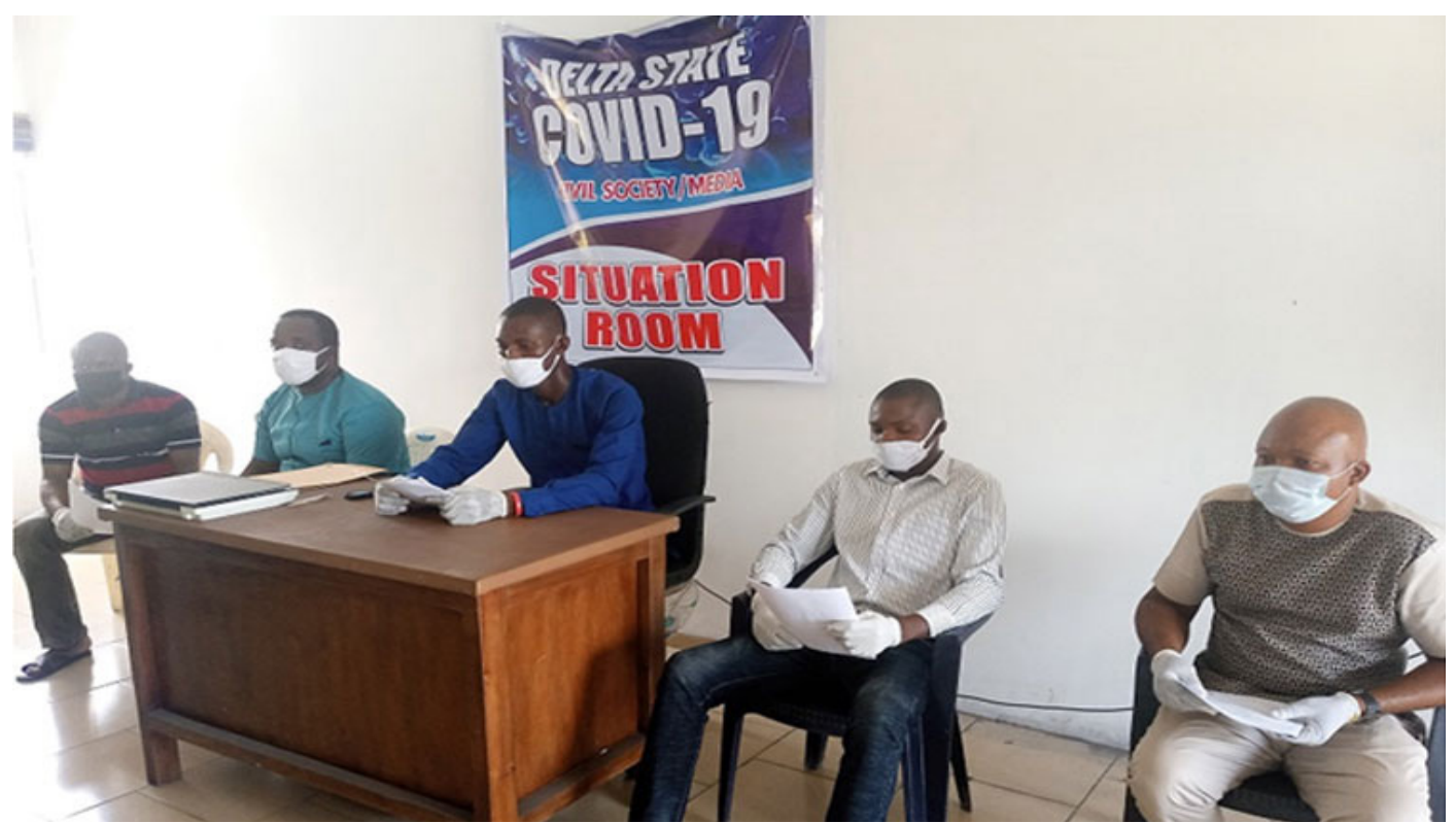
Covid-19 Civil Society/Media Situation Room deliberating on findings of field monitorings

NGOs/coalitions, media houses, independent journalists, civic opinion leaders and experts. While observing social distancing recommendations, the Situation Rooms issued daily briefings and organised weekly press conferences.