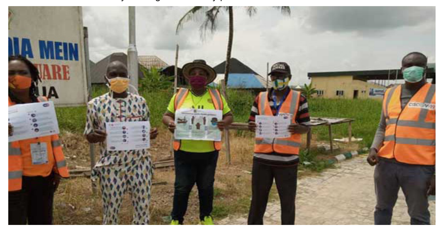
Monitoring human right of citizens while enforcing the compliance of the Covid-19 guidlines by agents

Action recruited members of communities in the Niger Delta states into Networks of Community Monitors to monitor human rights practices, management of government palliatives, and the environmental situation during the COVID-19 pandemic. The group maintained social media platforms, including WhatsApp group chat for information sharing and dissemination. Reports of the Monitors informed the daily briefings and weekly press conferences of the Situation Rooms.